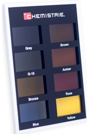
SOLID SUNLENES SAMPLE SHEET