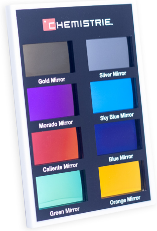
MIRROR SUNLENES SAMPLE SHEET

CHEMISTRIE WILL TAKE YOUR REVENUE TO THE NEXT LEVEL!